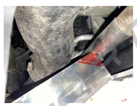
Adjust the possible touching exhaust clamp